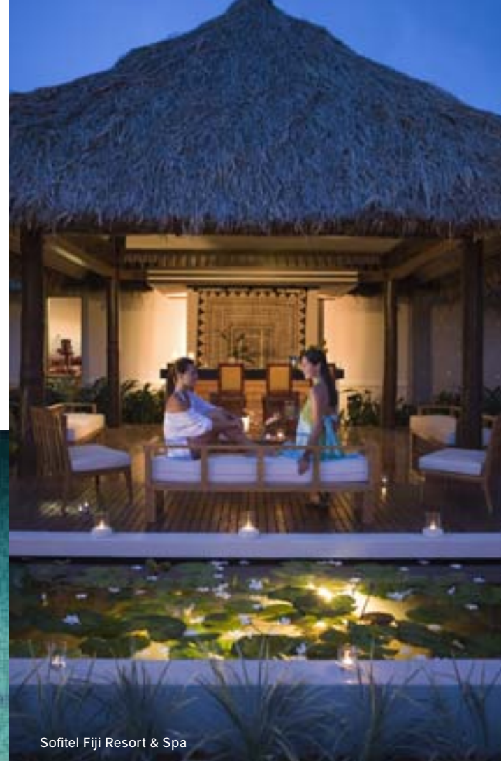
Sofitel Fiji Resort & Spa

Voyages Hotels & Resorts is offering the ultimate in experiential travel with the option to exclusively rent an entire luxury resort at any one of their six breathtaking properties. You can enjoy the indulgence of booking an entire private island or luxury resort all to yourself (and a few select friends), complete with all the trimmings - luxury accommodation, personal housekeepers, world-class chefs and total privacy! Choose any one of Voyages resorts, including tropical Lizard, Bedarra and Wilson islands; outback beauties El Questro Homestead and Wrotham Park Lodge, and Australia's first luxury camping experience Longitude 131°. Phone 1300 134 044 or email conferences@voyages.com.au