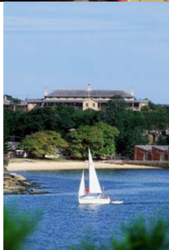
PHOTOGRAPHER NAME HERE

The former Quarantine Station reopened its doors as Q Station on ANZAC Day this year, offering accommodation and conference facilities with spectacular views of Sydney Harbour. Set on 30 spectacular hectares on Sydney's North Head near Manly, Q Station offers the unique blend of serenity and relaxation, yet situated only 15 minutes from the heart of Sydney's CBD. This amazing property is the result of more than 9 years' work and $17.3 million. Along with the Sydney Opera House, it is listed on the National Estate - one level below World Heritage significance. The Q Station Destination Spa opens later this year and if it's anything like the rest of Q Station, it will be truly world class! www.qstation.com.au