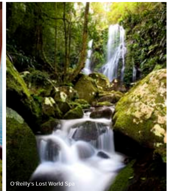
O'Reilly's Lost World Spa

For hundreds of years throughout Thailand, people would leave a jar of water outside their house to provide refreshment and extend a welcome to passing travellers. 'Anantara' is taken from an ancient Sanskrit word that means 'without end', symbolising the sharing of water and heartfelt hospitality that is at the core of the Anantara spa experience.