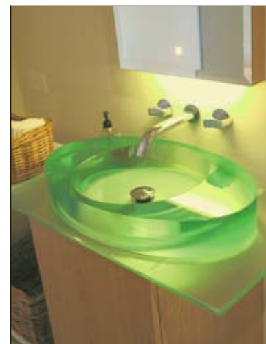
End detail: Powder room.