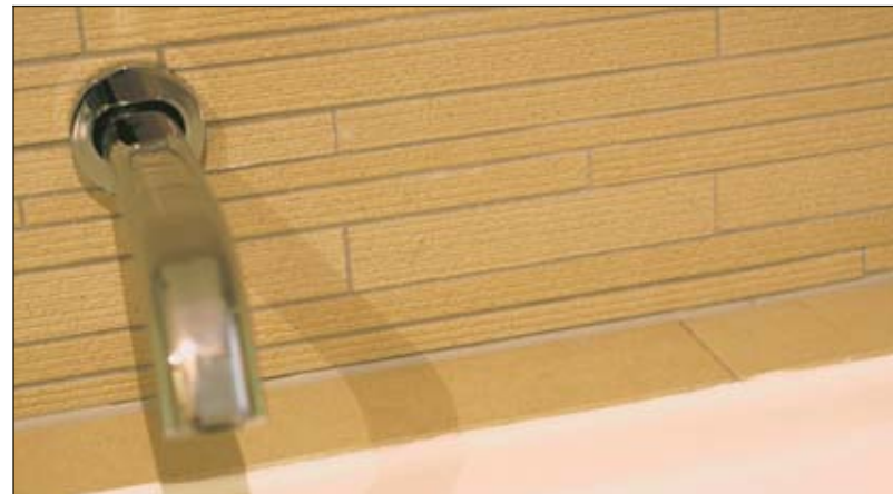
Finishing touch: Designer tiles in the bathroom.