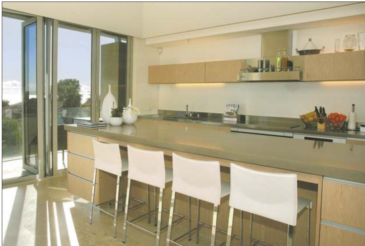
Contemporary fit-out: Most clients use an interior designer to assist with bringing their ideas into one cohesive look.

Interior designer Dominique Tiller's style is the embodiment of laid-back luxury. Evoking a refined Australian feel, her interiors favour natural materials and beautiful, layered textures, providing tactility, warmth and an effortless feel to classic or contemporary interiors.